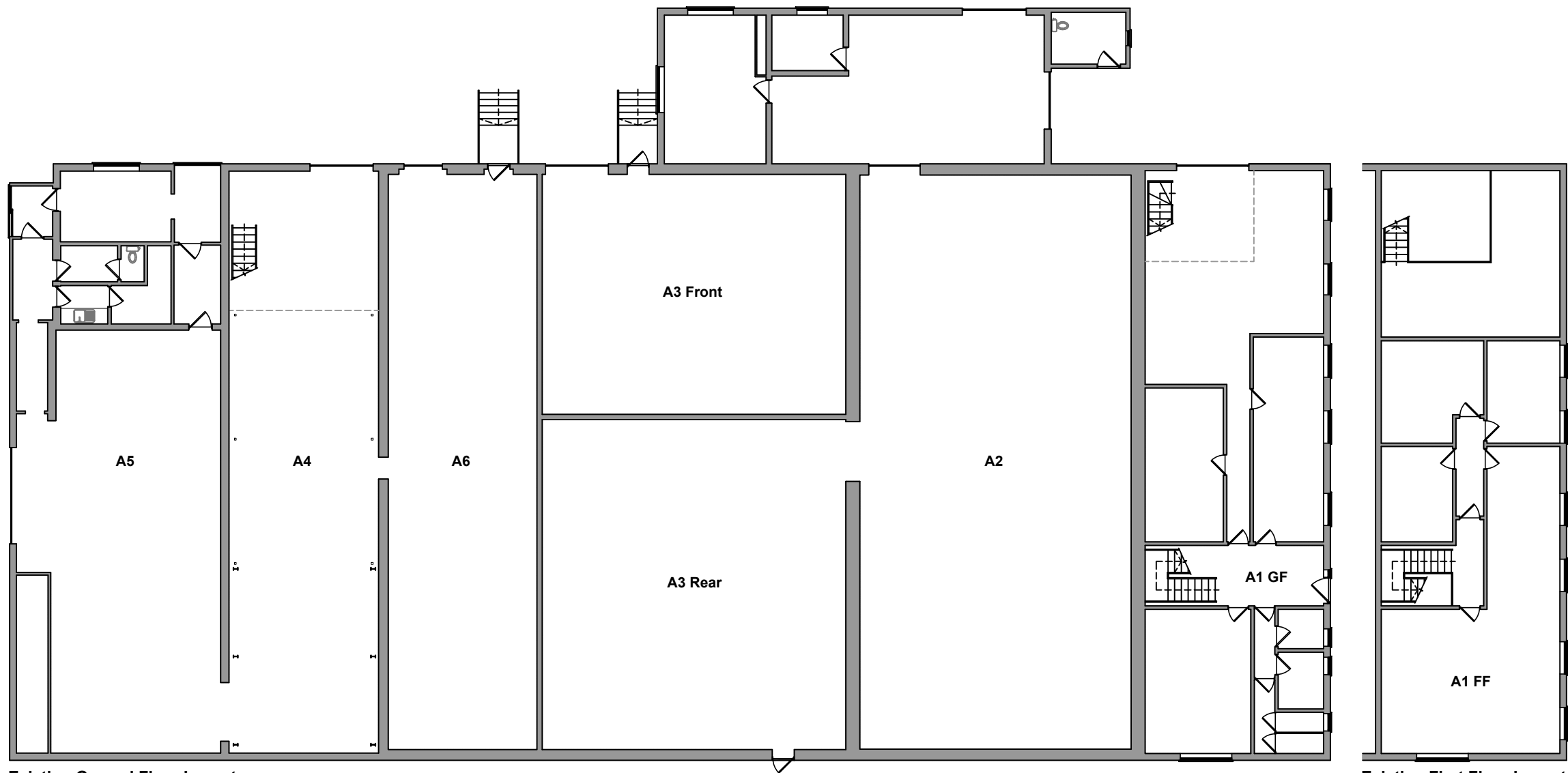
Existing Ground Floor Layout